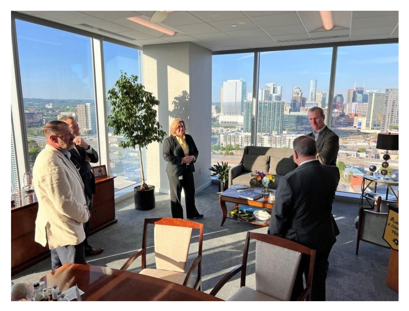
Visitors check out offices and views

Located at 1600 West End Ave., Broadwest is a 1.2 million-square-foot urban, mixed-use complex and business park – with office space, high-end condominiums, a luxury hotel and retail space. It includes a 21-story office tower with